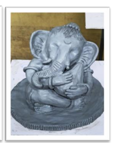
Winning entries of Shadu Clay idol competition