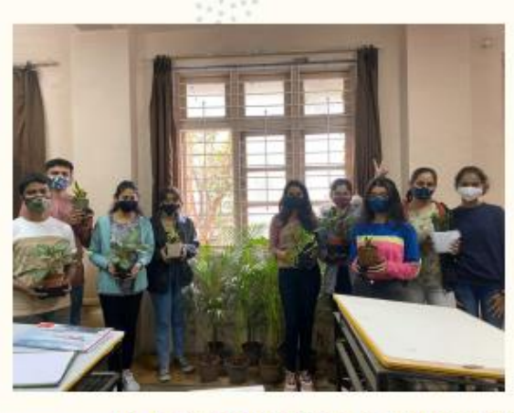
PLANT ADOPTION BY STUDENT