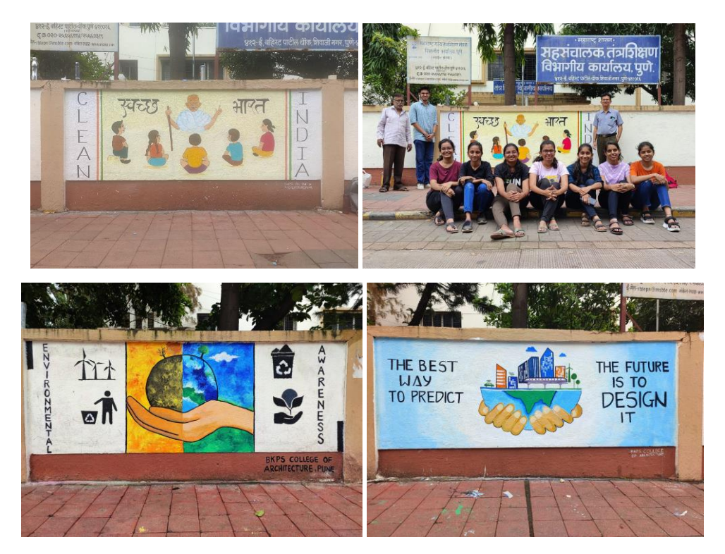
Under Swach Bharat Abhiyaan and activity under NASA BKPSCOA students did wall paintings on various themes related to environmental awareness.